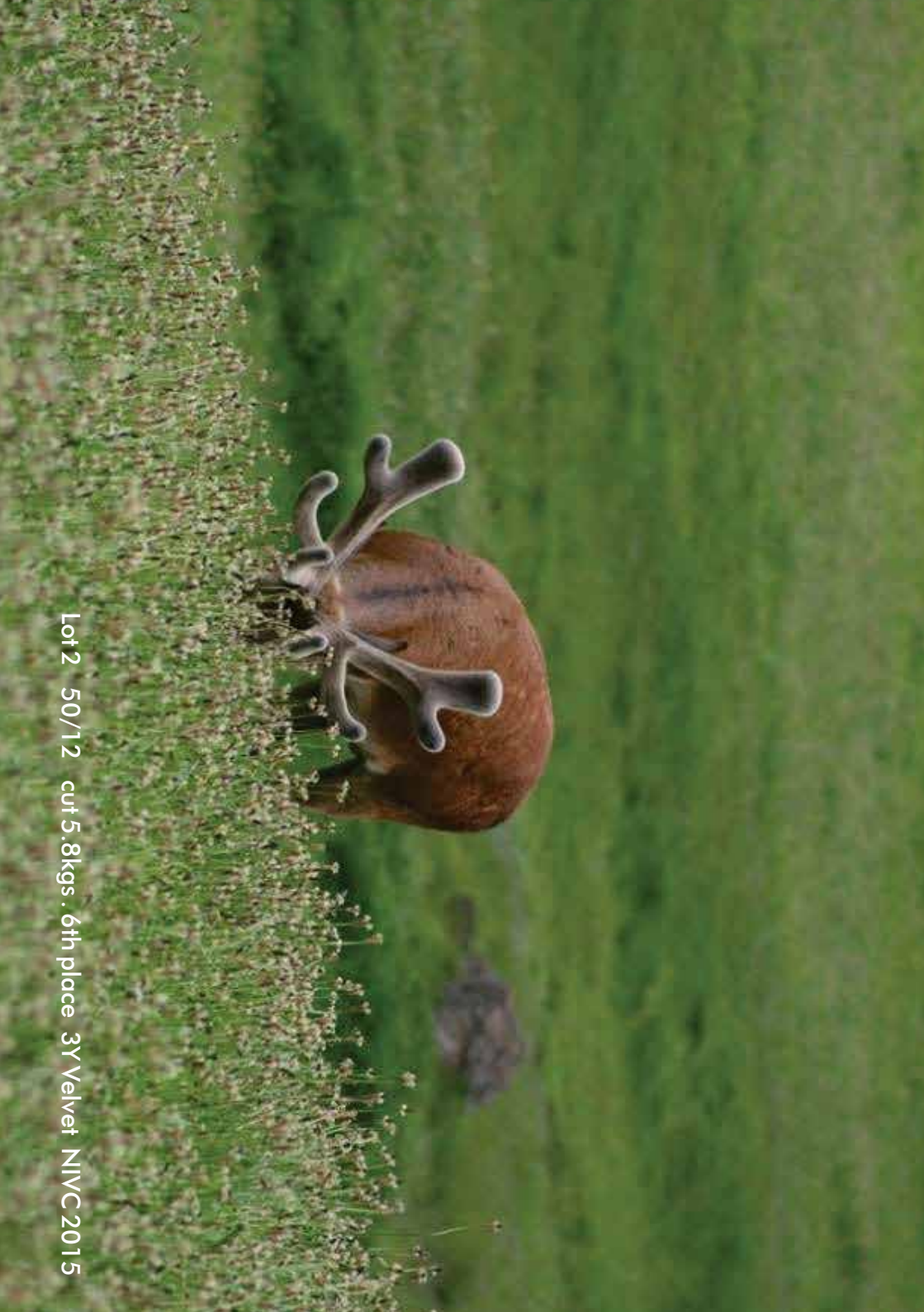
Lot 2 50/12 cut 5.8kgs . 6th place 3Y Velvet NIVC2015